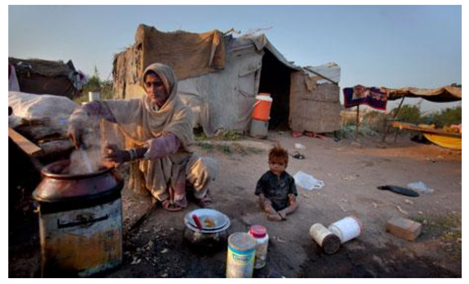
For some families in the developing world, home is a shack and kitchen is in the open compound. Poverty eradication must be a central concern of the SDGs, and the global factors must also be addressed to make the national policy measures possible.