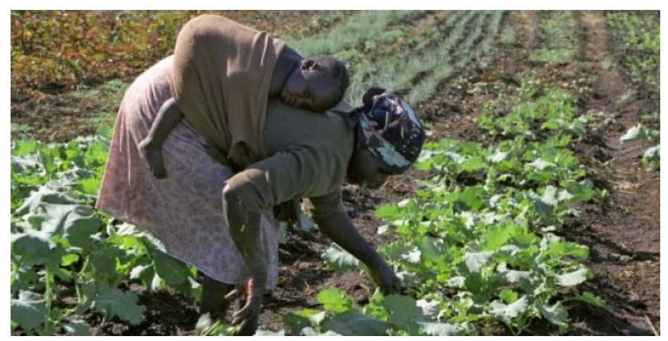
Rural livelihoods that provide enough income is a major component of "Full Employment".