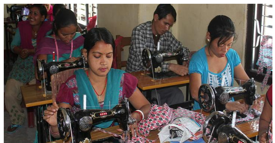
Full employment should be a top-priority goal of the set of SDGs and for the Post–2015 Development Agenda.

This paper first stresses the global dimension (what developed countries and international organisations can do for developing countries) in each goal, then addresses national level efforts, and concludes with means of implementation (finance and technology).