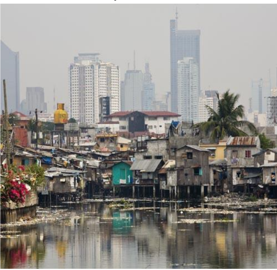
Slum houses in an unhealthy environment co-existing with modern high-rise buildings is a stark contrast that depicts poverty and inequality -- two issues that should have priority in the Development Agenda.

Without this, progress in human and social development would naturally depend on external and domestic transfer mechanisms - that is, aid and redistribution of public spending, respectively. Since there are limits to such transfers, social progress cannot go very far without an adequate pace