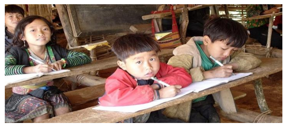
Sustainable development, a rich and complex concept, should be operationalized to give a safe and sound future for our children

ment and serve as a driver for implementation and mainstreaming of sustainable development in the United Nations system as a whole.