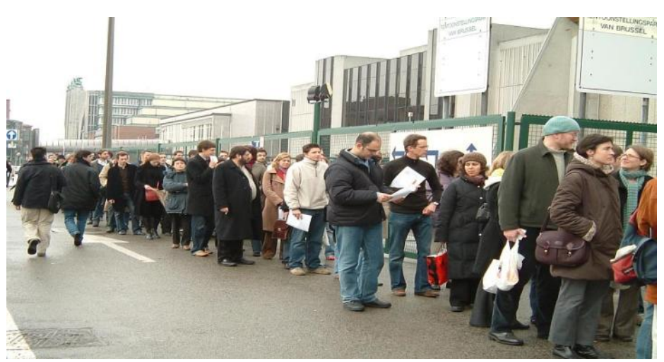
Unemployment line: Unemployed citizens in Europe lining up for unemployment benefits. Most developing countries cannot afford such benefits—it is a better strategy to ensure full employment.

(This paper was written by Martin Khor, Executive Director of the South Centre.)