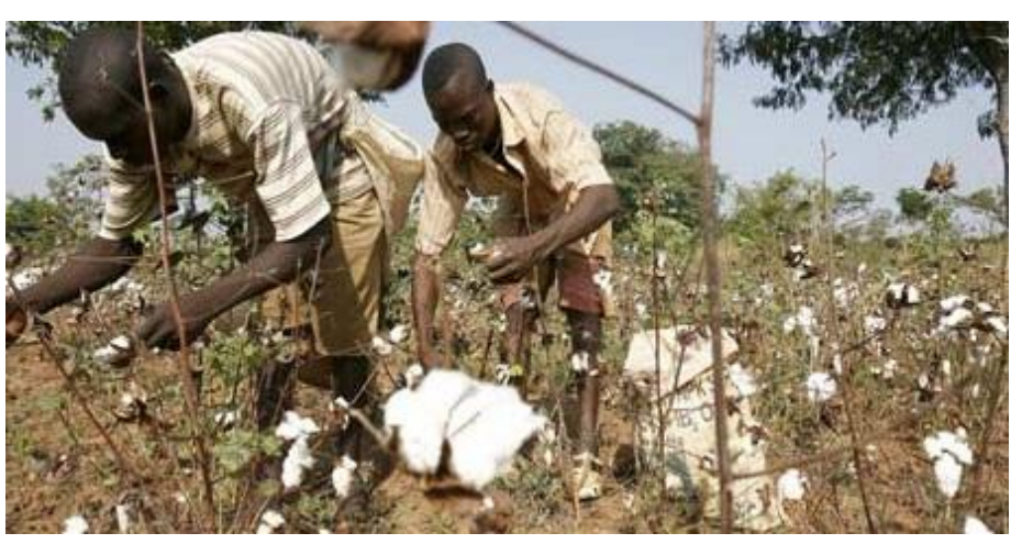
Farmers in Ivory Coast hand pick cotton. These poor cotton farmers would have a better income if cotton subsidies in rich countries are reduced or eliminated.

There are still massive amounts of subsidies and supports provided by the developed countries. According to OECD estimates, the subsidies given to farm producers in all OECD countries