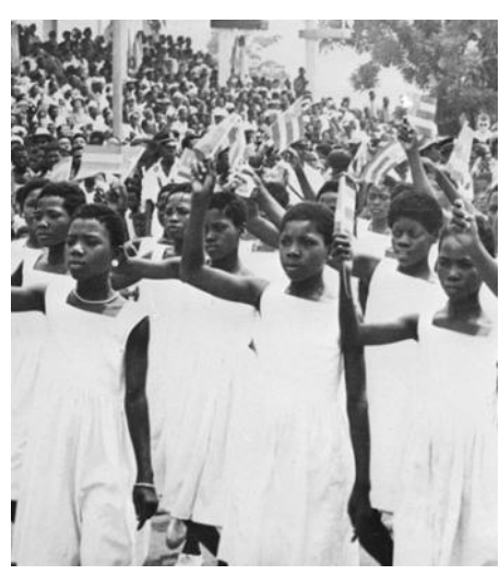
Children take part in Independence Day celebration in Togo in 1960: The struggle for de-colonization continues in many developing countries.

The availability and cost of medicine, the overwhelming proportion of which is still sourced from developed countries, has been a sore point for developing countries for a long time. Moreover, too much (as compared to the afflicted population) research and medical production are oriented toward diseases and maladies in the developed countries. Should there be agreed global goals in terms for the "right" kinds of medicines and their affordability? Which parties should accept these goals as their obligation?