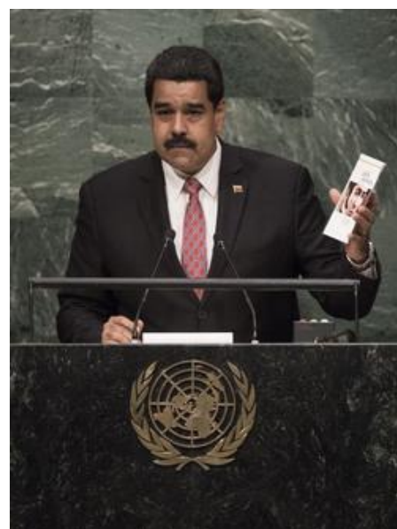
President Nicolas Maduro of Venezuela

Evo Morales, President of Bolivia , emphasized that it was important to take deep stock of the political, social, cultural and environmental achievements of the United Nations since its founding. He said that 70 years on, wars and invasions continued caused by ambitions of certain regions and nations, and the policy of keeping capital in the hands of the few. "We are convinced that capitalism is not the solution for humanity," he said and emphasised that the principle of "living well" - living in solidarity and complementarity, at one with Mother Earth - is the key for humanity. Morales said that living well means en-