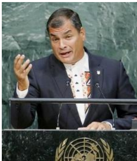
President Rafael Correa of Ecuador.

CELAC has declared the region a zone of peace but that outrageous opulence of a few, next to the most intolerable poverty, are also daily bullets against human dignity. The 164 million people in Latin America living in poverty, 68 million of whom remain in extreme poverty, are still waiting for justice, freedom and real democracy, which should not only be reduced to holding elections regularly. Overcoming poverty is the major imperial moral for the planet, and for the first time in the history of mankind, poverty is not the result of lack of resources or natural factors but of unfair and exclusionary systems, the result of perverse structures of power.