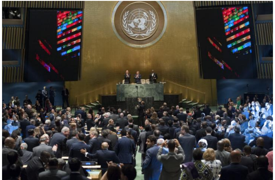
The General Assembly adopted the 2030 Agenda for Sustainable Development during a United Nations Summit on Development held on 25-27 September at the UN headquarters in New York.

The United Nations held a Development Summit on 25-27 September, attended by many top political leaders. The Summit adopted the 2030 Agenda for Sustainable Development, which will have a major impact on how development will be dissected and monitored in the UN and at country level in the next 15 years.