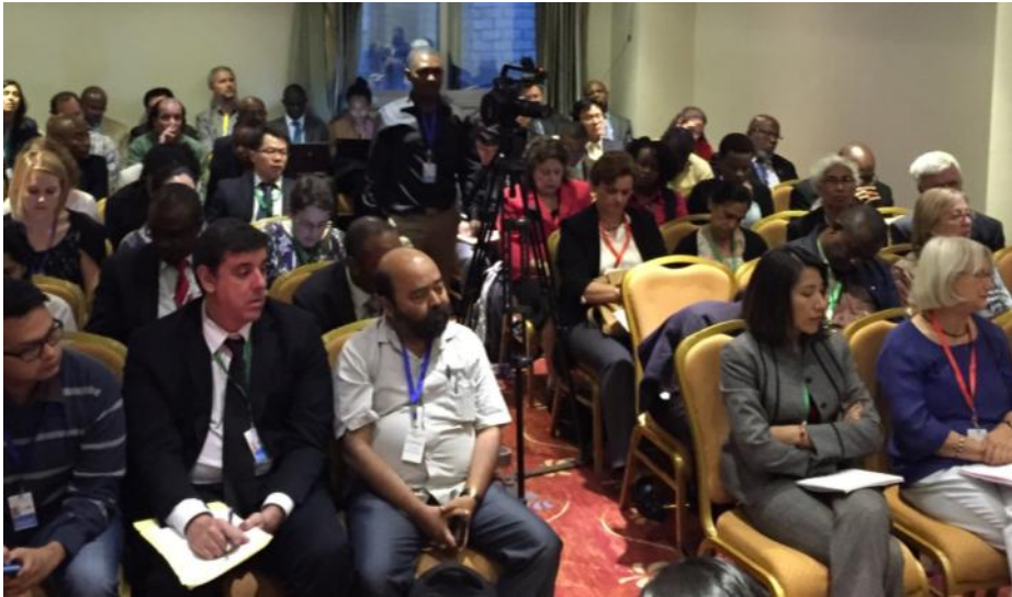
Participants attending the South Centre side event held in Addis Ababa on the first day of the Third Financing for Development Conference, 13 July 2015.

structuring the global system so that it works for development (systemic issues).