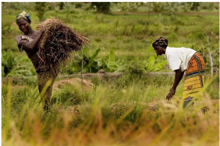
Women make essential contributions to agriculture in developing countries, but their roles differ significantly by region and are changing rapidly in some areas. Women comprise, on average, 43 percent of the agricultural labour force in developing countries, ranging from 20 percent in Latin America to 50 percent in Eastern Asia and sub-Saharan Africa. Women are a powerful force in agriculture.

He said: "We welcome the commitment to the Global Partnership in the post-2015 development agenda. We call on the Development Partners to upscale Overseas Development Assistance, with binding timetables. We also reiterate that climate financing is new and additional to and cannot be counted as ODA, nor can it be mixed with tradi-