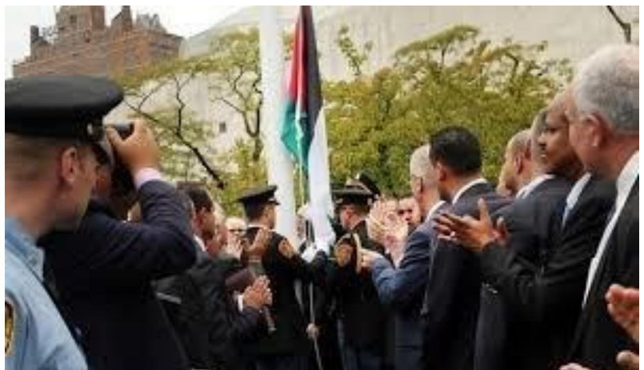
The Palestinian flag being hoisted at the UN in an emotional ceremony on 30 September 2015.

Several leaders of the South countries have used the UN General Assembly