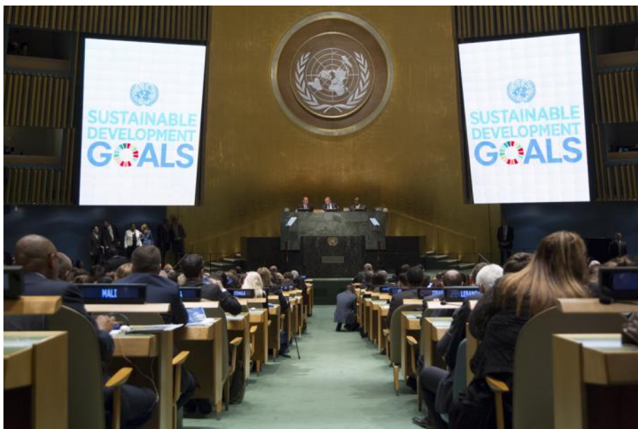
The UN Sustainable Development Summit in session.