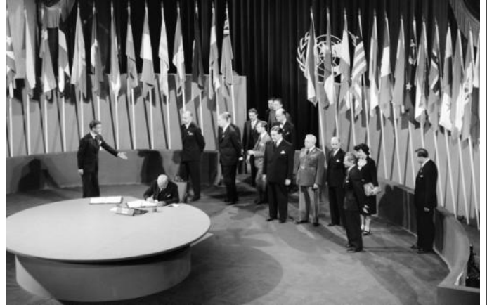
1945, San Francisco Conference – UN Charter opens for signature: Brazil signs United Nations Charter.

to denounce the unfairness of the current injustices of the international economic and political system which have contributed to spread poverty, raising inequality and destabilization with peace and development turning into a dream so far not achieved for many people in the developing countries and, ironically, now also a problem of developed country nations despite all their resources. They made a strong call for a new era in which the principles en-