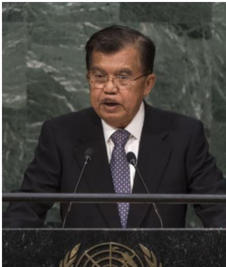
Vice-President Muhammad Jusuf Kalla of Indonesia