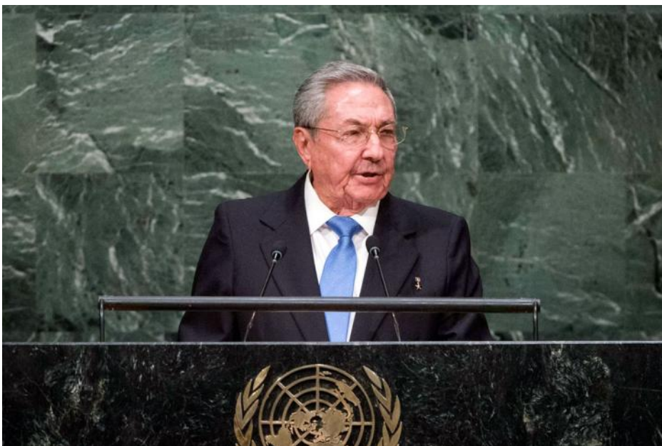
Cuban President Raúl Castro addressing the UN General Assembly .