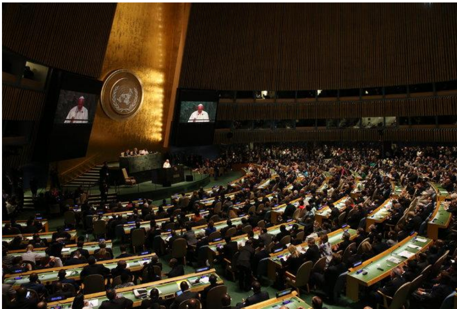
Pope Francis addresses the General Assembly.

Since Independence, his country has pursued the dream of eliminating poverty from India. "We have chosen the path of removing poverty by em-