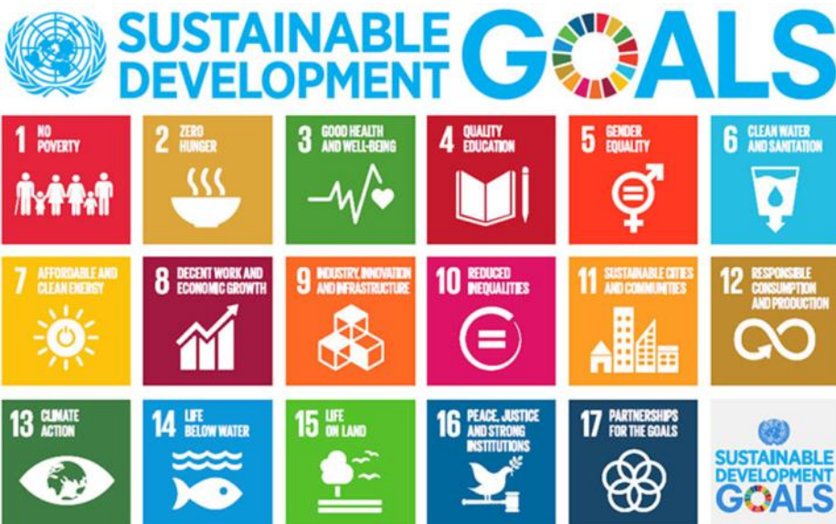
The UN Sustainable Development Summit held in New York on 25-27 September formally adopted an ambitious new sustainable development agenda with 17 Goals.

All in all, the 2030 Agenda adopted by the UN Summit is comprehensive and ambitious in scope. It provides framework with recognisable goals and quantitative targets for individual countries and their publics to aim for. The preamble to the Declaration states: "The 17 Sustainable Development Goals and 169 targets which we are announcing today demonstrate the scale and ambition of this new universal Agenda.... They are integrated and indivisible and balance the three dimensions of sustain-