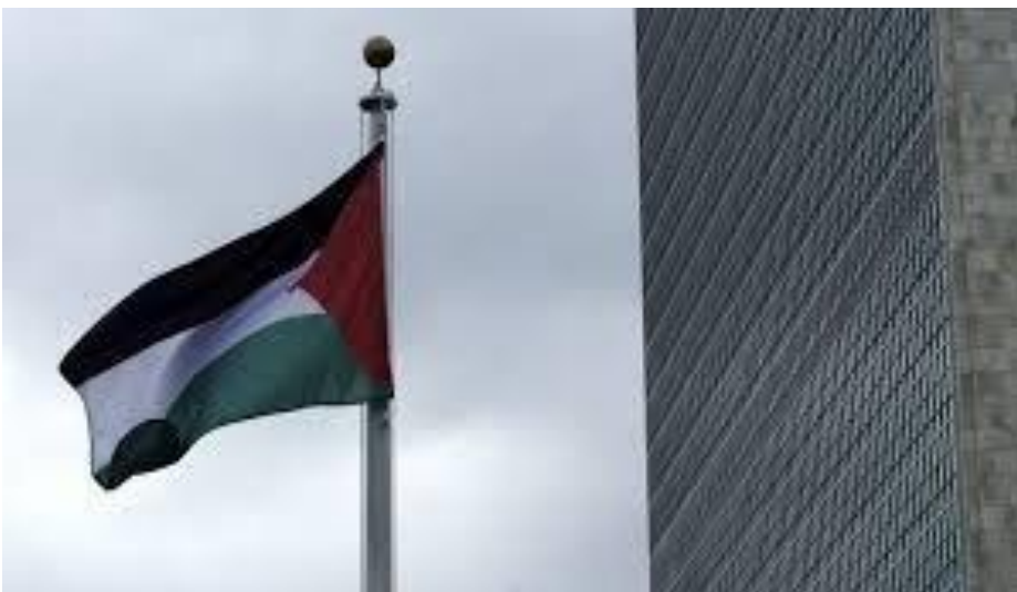
Palestinian flag flying over the UN .

The International Monetary Fund and World Bank systems created under an era of global dominance by developed countries and the colonial system were also at the centre of attention of developing country leaders as the economic and financial crisis, which begun in 2008 in the United States, is still an issue and now impacts severely many in the south. The decision making process in economic and financial issues is unbalanced and most of the promised reforms are yet to be implemented. Their policies led to great crises in the south and as result new south led architectures of economic and finance governance are now emerging and will serve as an alternative to north dominated structures as well as to push them for long awaited reforms.