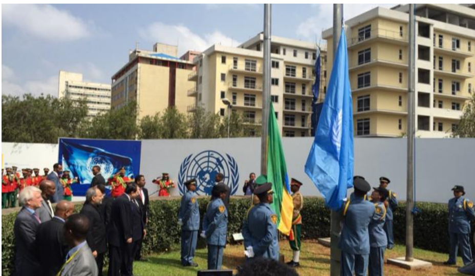
Flag ceremony at the UNECA office in Addis Ababa marks the opening of the Third UN Financing for Development Conference.