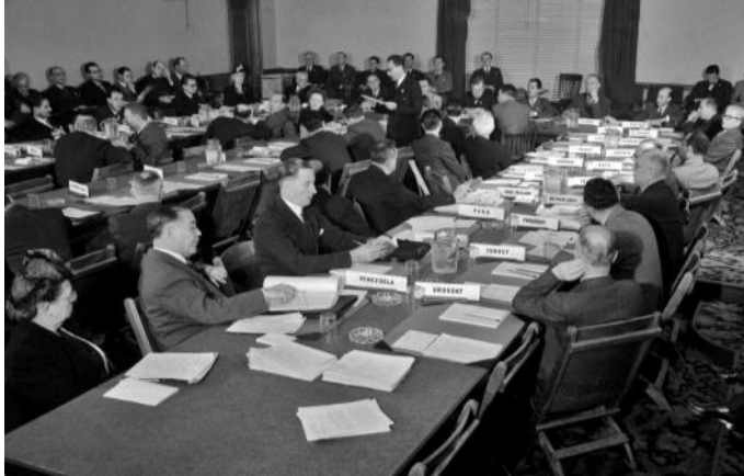
Delegates of fifty nations met at San Francisco between 25 April and 26 June 1945 to hold the United Nations Conference on International Organization.

As we celebrate its 70 th year, and with 193 members today, leaders gathered in New York reflected on its achievements and the challenges ahead for the organization. They have called for enhanced global efforts in order to make justice to the principles for which the organization was initially thought – to build an era of peace, justice and development for all humanity.