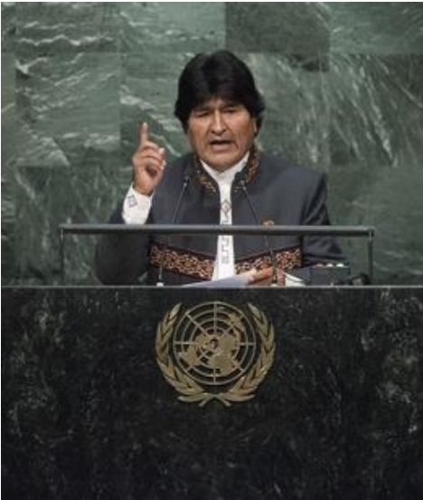
President Evo Morales of Bolivia

sureing that basic services and natural resources belonged to all people, not private companies. "This is how we freed ourselves economically," Morales stated. As many leaders spoke before him in the UNGA tribute on peace, he was emphatic in saying that there is no peace without social justice, a reasoning made by numerous South leaders in the debate of the UNGA 70 th session. Some governments claimed to be spending billions of dollars to save Mother Earth, but they were really spending those billions on military aims which would ultimately lead to the destruction of the planet.