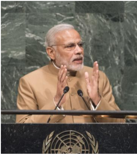
Prime Minister Narendra Modi of India