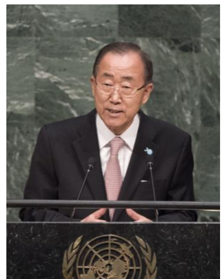
UN Secretary-General Ban Ki-moon

He stressed the need for preservation of the environment and the challenges posed by climate change. A selfish and boundless thirst for power and material prosperity leads both to the