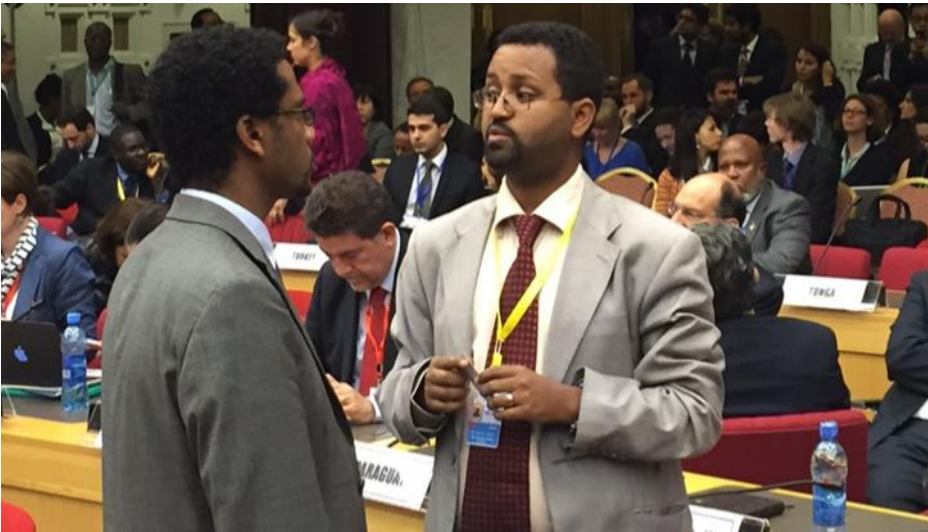
Government official of the hosting country (right) talks with delegates on the hall of the Third FfD.

nized that developing countries need to have their own resources for development. As of today, we do not have such a forum where developing countries could engage discussion on this issue, he said.