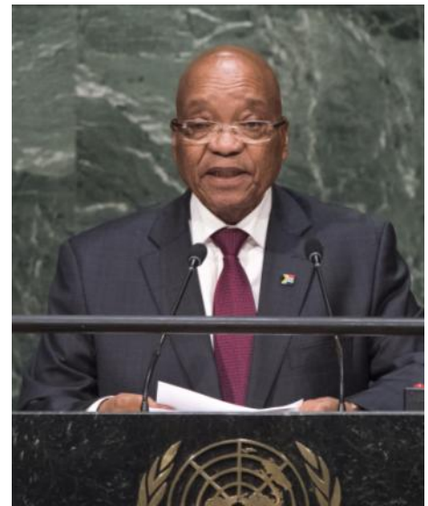
President Jacob Zuma of South Africa

On the way to implement the Agenda 2030, the triple challenge of poverty, unemployment and inequality is the primary focus of South Africa.