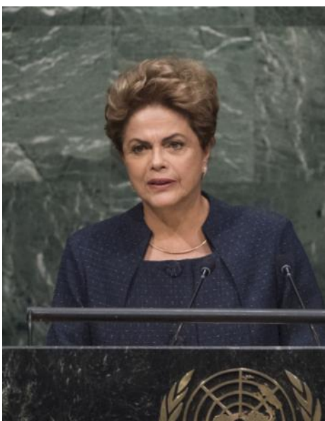
President Dilma Rousseff of Brazil.

Brazilian President Dilma Rousseff said that SDGs reaffirm the basic tenet of Rio+20: it is possible to grow, include and preserve and protect. The innovative agenda will require global solidarity, determination from each one of us, and a commitment to confronting climate change, overcoming poverty and creating opportunities for all. She called for the