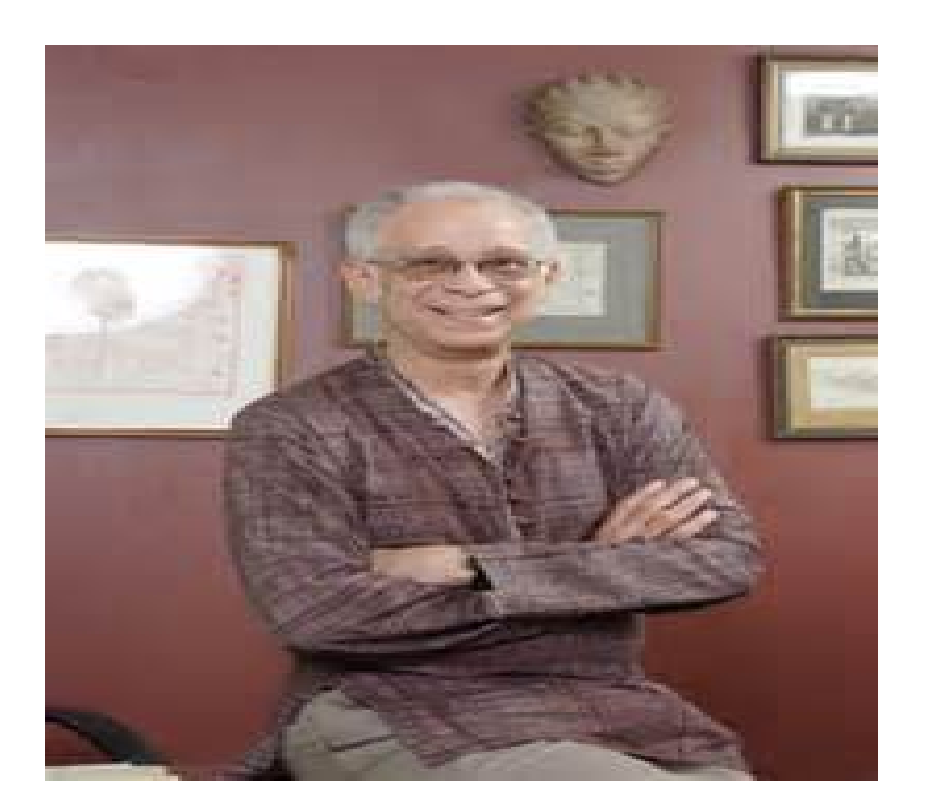
"Those whose death is in the cause of life we cannot say that they die. At the moment of their parting for them it is forbidden to cry".— Ali Primera (Venezuelan Poet)