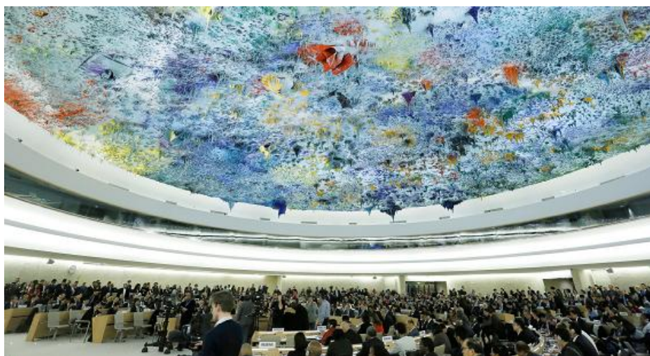
The Human Rights Council takes place in Room XX at the Palais des Nations in Geneva, with the beautiful ceiling by Spanish abstract artist Miquel Barceló.