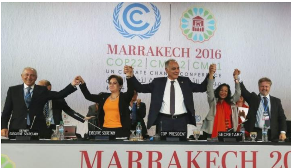
Celebration at the podium at the conclusion of the Marrakech COP22 meeting. The COP has ended but the battle of interpretations of the Paris Agreement will continue this year.

A year after the historic Paris Agreement was adopted, the UN Climate Change Convention held its 22 nd Conference of Parties in Marrakech in November 2016. The Paris Agreement has come into force, in record time, but as the COP22 showed, there are big differences on what Parties understand the Agreement to mean. The article below explains this battle of interpretation and other highlights of the Marrakech meeting.