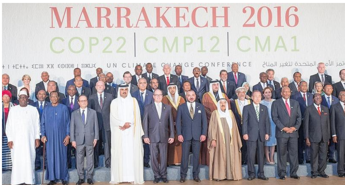
Heads of states and governments take a group photo at the Marrakech COP22.

of issues in the NDCs. The LMDC was of the view that any technical work could not be advanced if this was not the understanding. They wanted a comprehensive understanding of what are NDCs so that all the components of NDCs are addressed in a balanced manner.