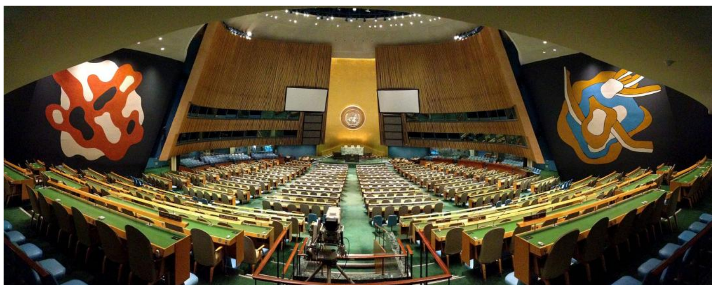
Panorama of the United Nations General Assembly. The Second Committee is the Economic and Financial Committee of the General Assembly.

Like what happened after the SDRM debate, with the global financial crisis, main attention has been turned to contractual improvements of bonds, whose outcomes are welcoming and important, but cannot solve systemic issues. For instance the new Collective Action Clause (CAC) can be