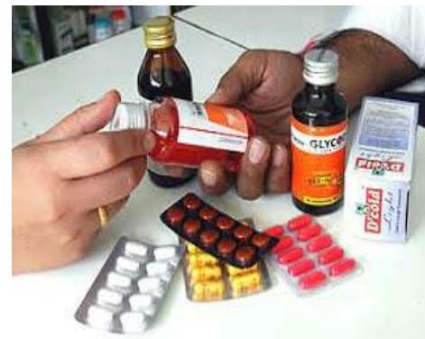
The amendment to the TRIPS agreement is aimed at helping poor countries increase their access to medicines but there are many obstacles to overcome for that to happen.

Below is the statement of the South Centre made on 27 January 2017 on the amendment to the WTO'S TRIPS Agreement to address what is known as the "Paragraph 6 issue" which has the objective of improving access to medicines for countries lacking capacity to manufacture pharmaceutical products.