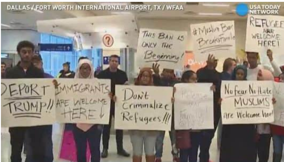
Trump's executive order to temporarily ban refugees and visitors from seven countries from entering the US led to protests and chaos including in airports like the Dallas airport above.