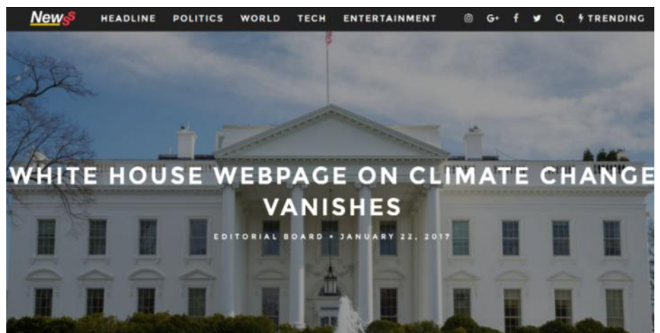
Above is a news report of how the White House web section on climate change disappeared on Trump's inauguration day, removing the information on former President Obama's actions on climate change. It was replaced by the Trump administration's views on energy, which was very different.

Other developed countries like Japan and the post-Brexit United Kingdom may be interested in starting negotiations with the US with its