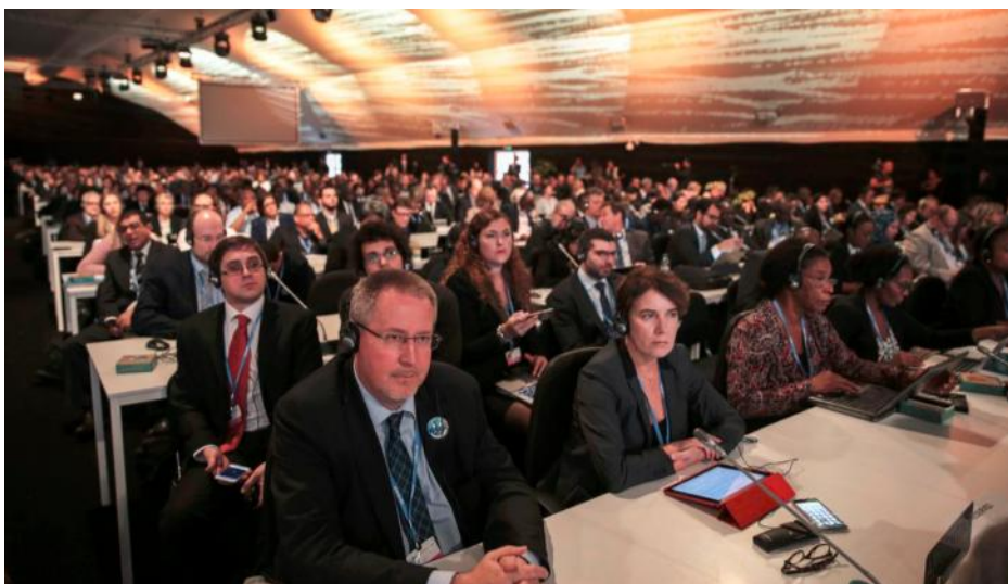
Delegates during the opening session of COP 22 in Marrakech.

the existing arrangements under the Convention have shown that a common but differentiated transparency framework on action and support can be developed and implemented effectively, while preserving and reflecting equity and the principle of common but differentiated responsibility (CBDR). The Arab Group had similar positions as that of the LMDC.