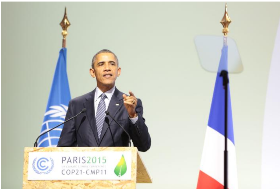
President Obama speaking at the Paris climate conference in December 2015. Now the world is wondering whether Trump will allow the US to remain a member of the Paris Agreement, or will pull the US out.

new template, in an attempt to get mutual benefits. It remains to be seen whether there would be developing countries willing to be new partners in what for them would likely be very one-sided bilateral agreements.