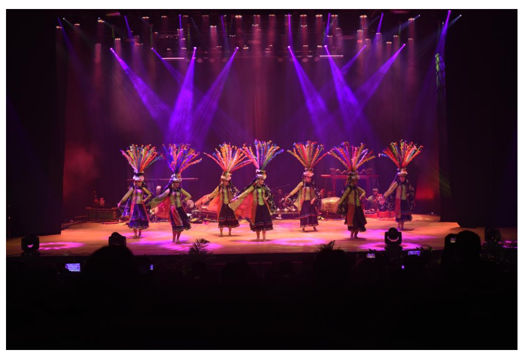
Cultural event at the Inaugural Forum.