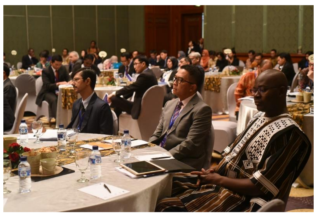
Participants at the Inaugural Annual Forum Developing Country on Tax Policies and Cooperation for Agenda 2030.