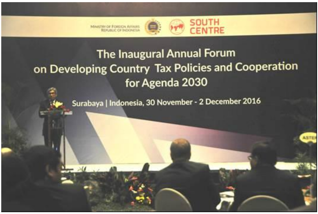
H.E. Ambassador Abdurrahman Mohammad Fachir, Vice-Minister of Foreign Affairs of Indonesia opens the Inaugural Annual Forum Developing Country on Tax Policies and Cooperation for Agenda 2030.