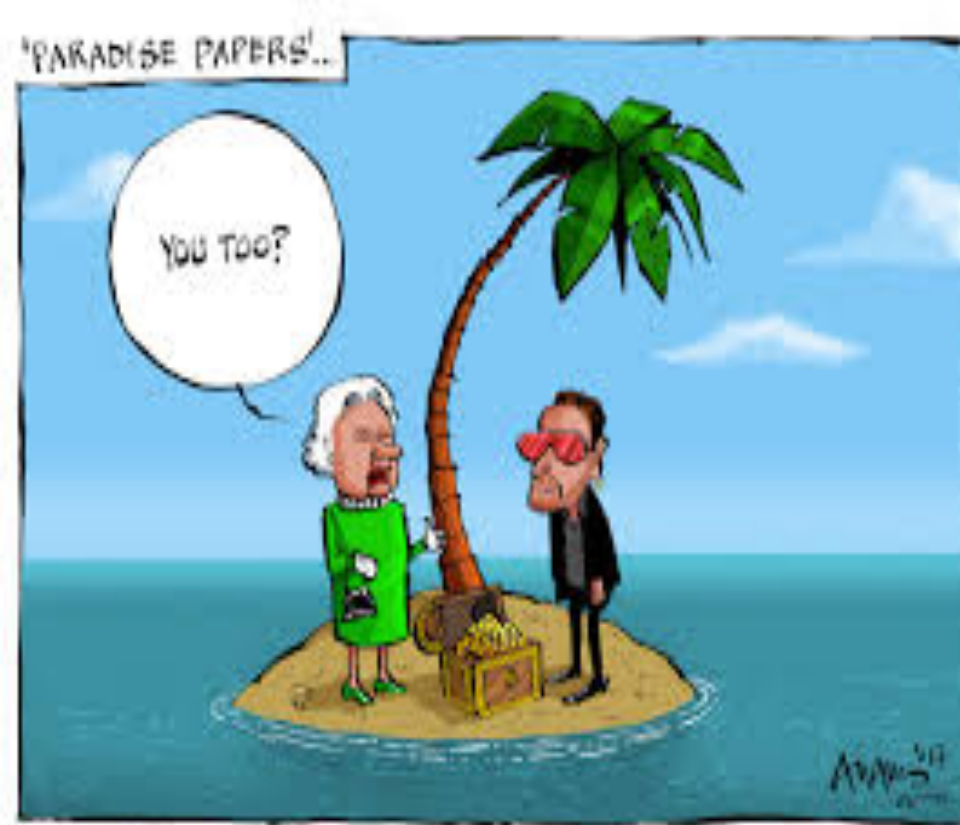
The Queen of England & Bono of U2 amongst the names – 2017- Law Firm Appleby- Bermuda