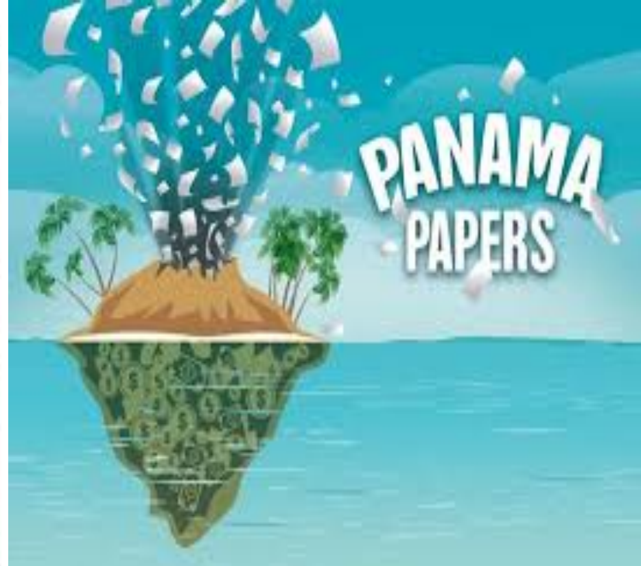
13.4 million documents – 2016 – Mossack Fonseca

Opaque financial systems (with some leaks!!)